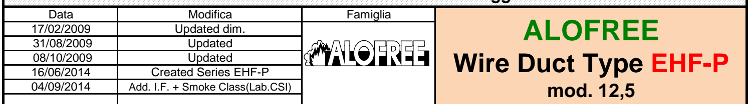
Tabella Info Tecniche Canali Cablaggio

CANALPLAST® S.p.A. via Tolstoi 65 - 20812 LIMBIATE (MB) - ITALY